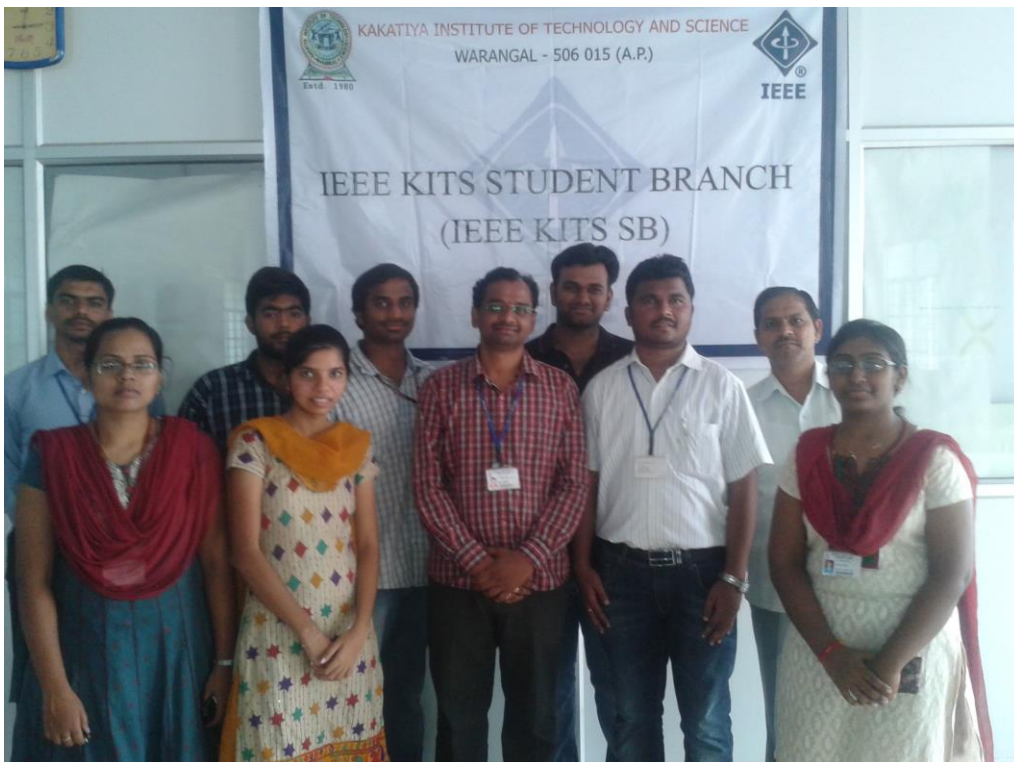
IEEE KITS SB team after successfully organizing NPL 2013