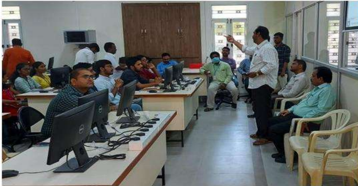
A workshop on Code Arduino - 2022