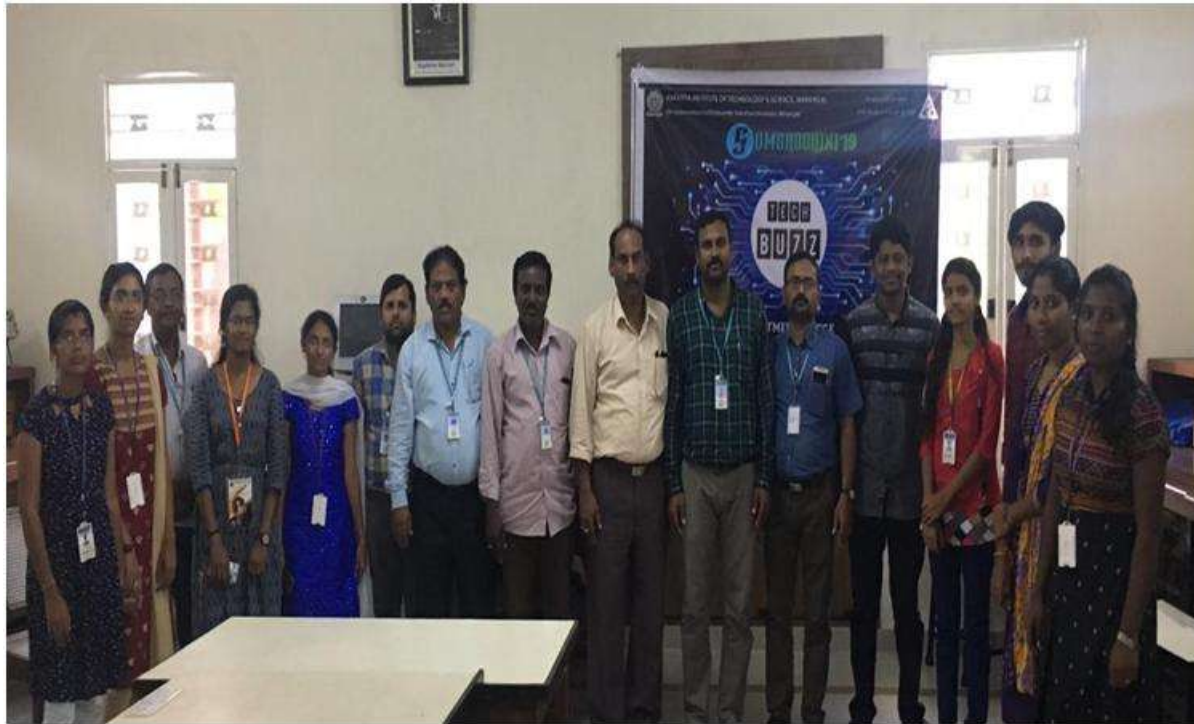
Techbuzz - a technical quiz conducted on 26th Oct, 2019