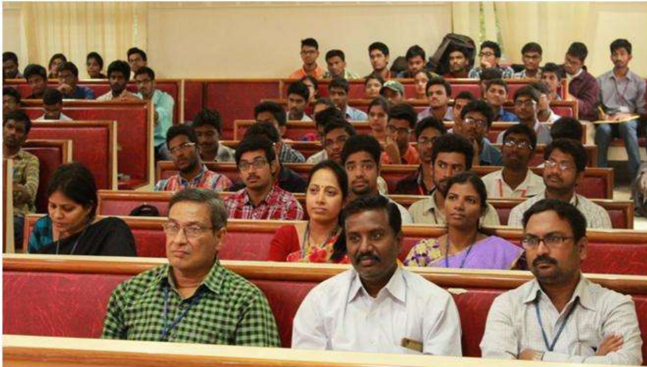
Inaugural session Techbuzz - a technical quiz, Circuitrix on 23rd January, 2016