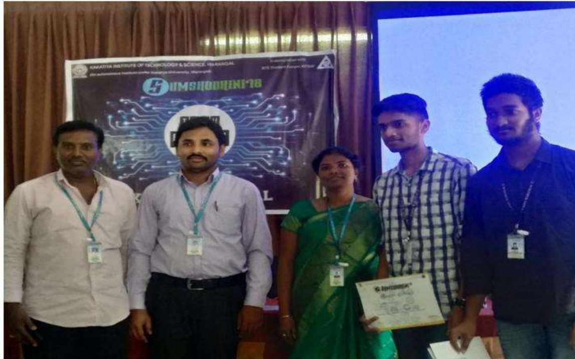
Techbuzz - a technical quiz conducted on 6th Oct, 2018