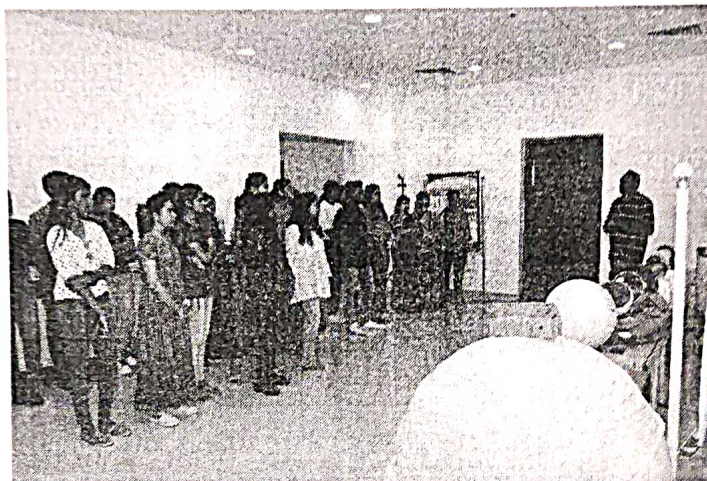
Figure 2: Marine fishery advices