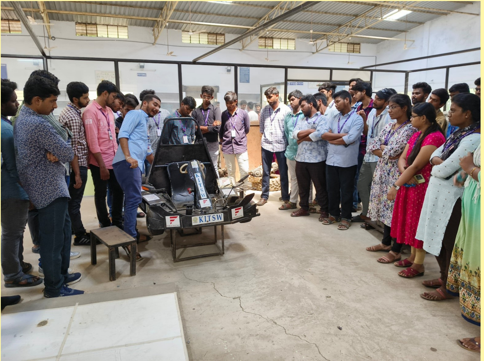
Importance of SAE activities for 3rd sem students during MESAsession