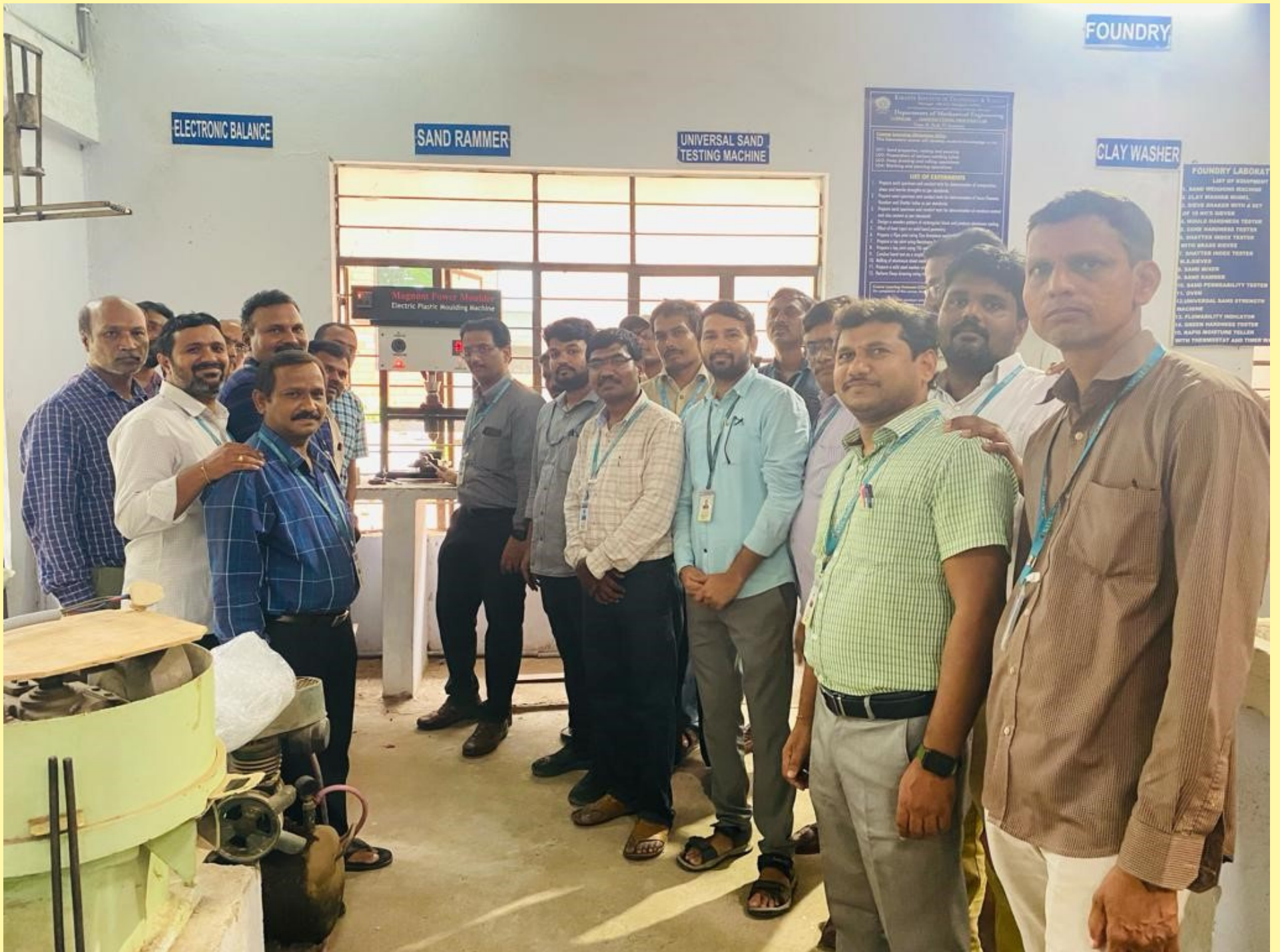
Training for faculty on Injection Molding Machine