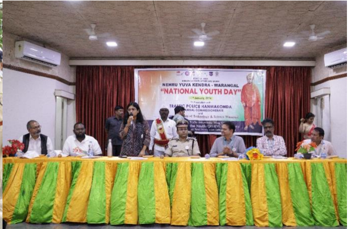
NATIONAL YOUTH DAY[14-02-24]