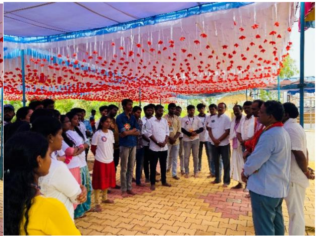
SHIVARATHRI [06-03-24 TO 08-03-24]